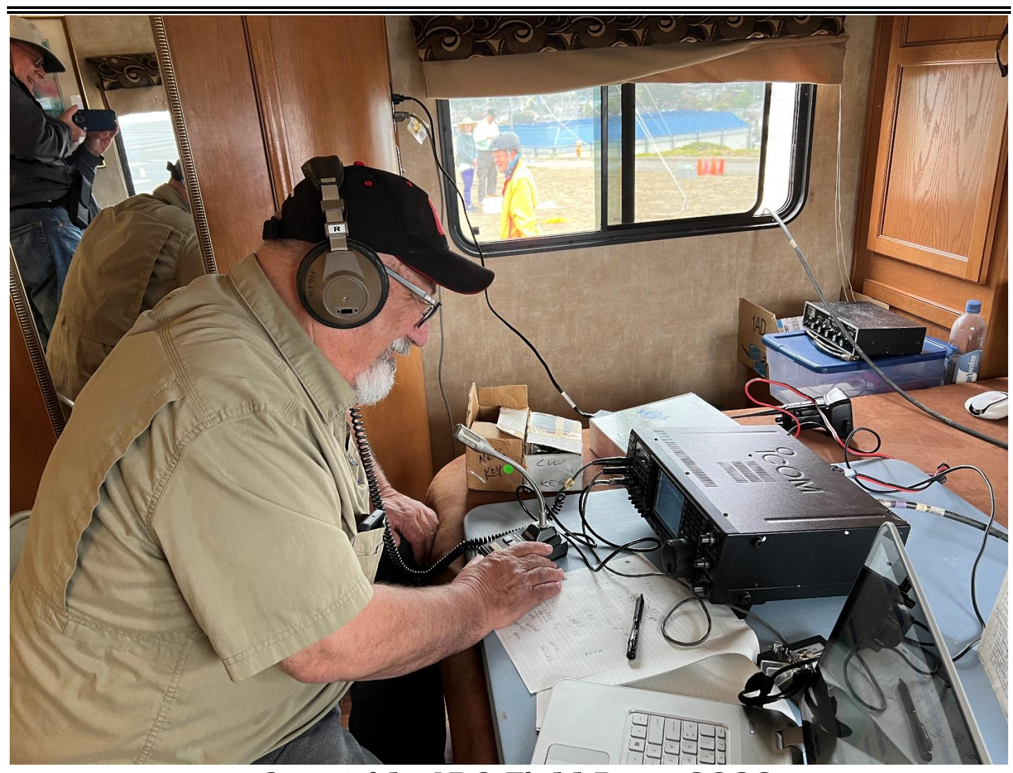
Coastside ARC Field Day - 2022